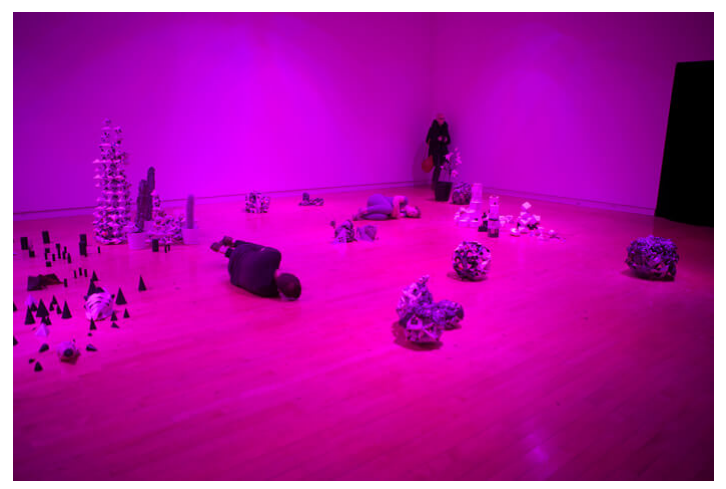
Jaewook Lee, Less in Known on Earth, 2015, various human-made and natural objects, LED grow light, performance, 33 x 33 x 13