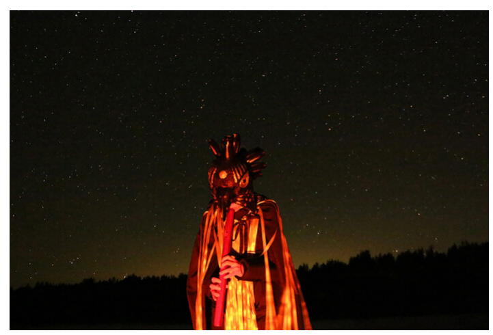
Jaewook Lee, Treatise on Rhythm, Color, and Birdsong, 2020, single-channel video with sound, 21 min.