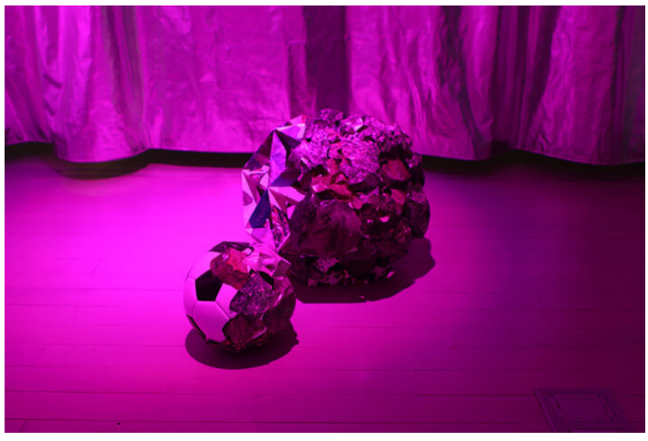
Jaewook Lee, Less in Known on Earth, 2016, book, soccer ball, LED grow light, 3 x 3 x 4 ft.