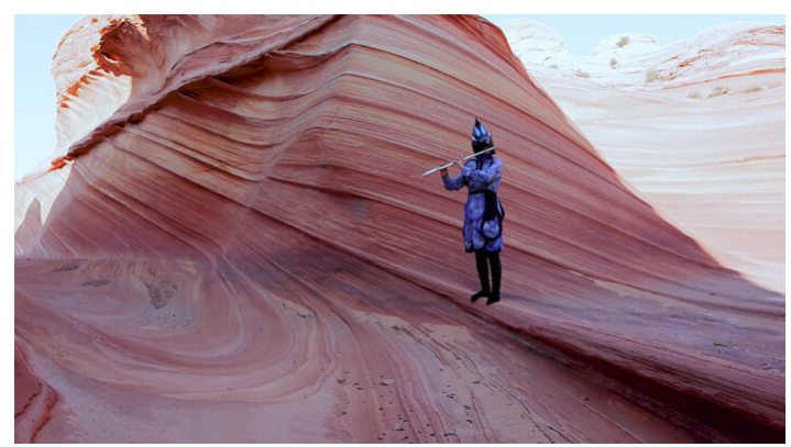
Jaewook Lee, Treatise on Rhythm, Color, and Birdsong, 2020, single-channel video with sound, 21 min.