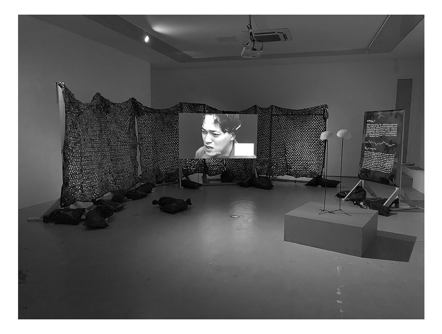
Figure 4.6 Jaewook Lee, Emphatic Audition, 2017, Single channel video with sound, 7 min 40 sec, Installation view, Buk Seoul Museum of Art, Seoul © Courtesy of the Artist.

Hearing about her sad story shook me deeply. My interest was no longer conceptual; I felt severe pain."43